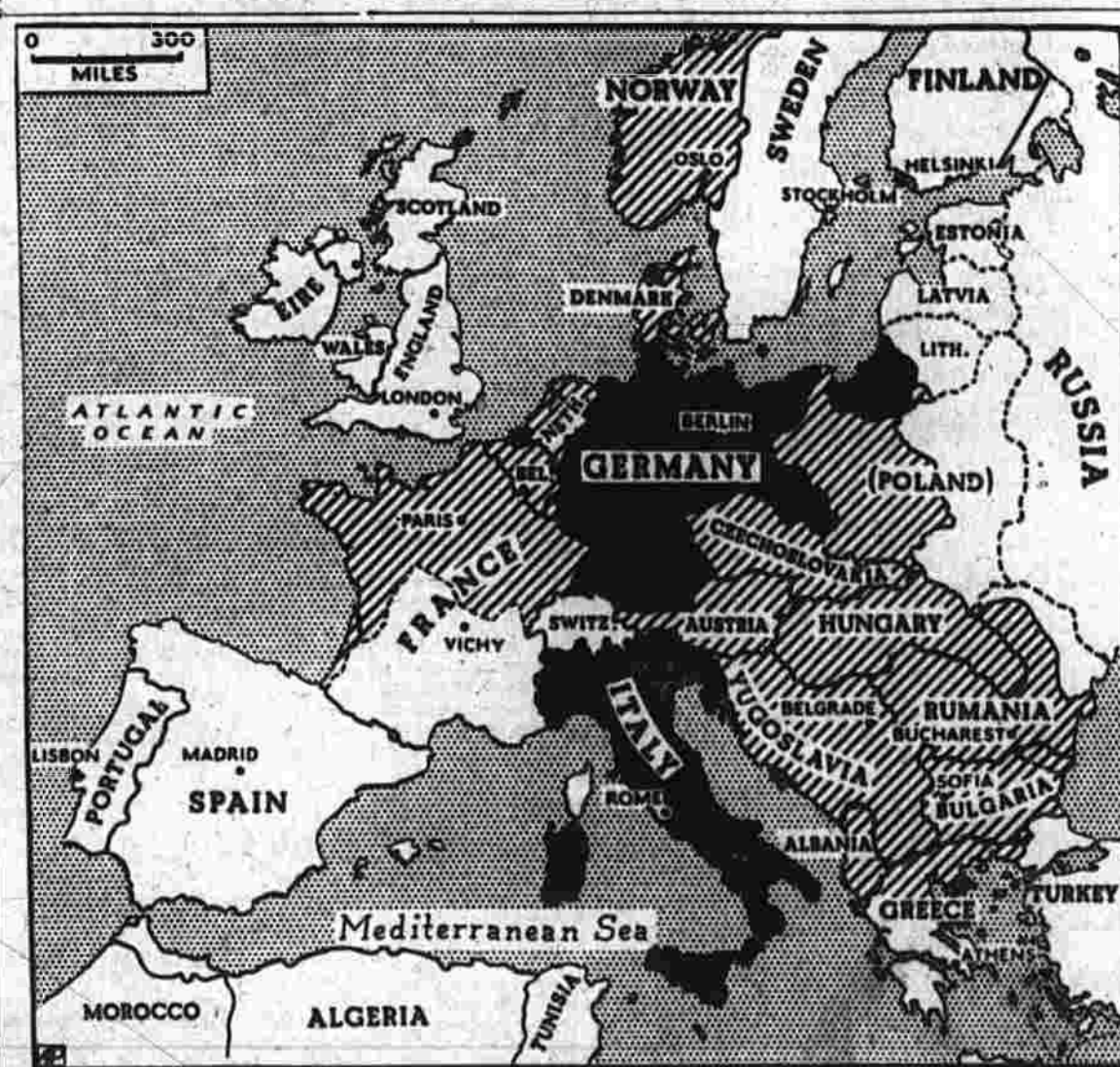
Dark areas represent Axis territory in Europe at the time Adolf Hitler sent his troops into Austria in 1938. The light gray shaded areas represent territory which has come under Axis domination since then.